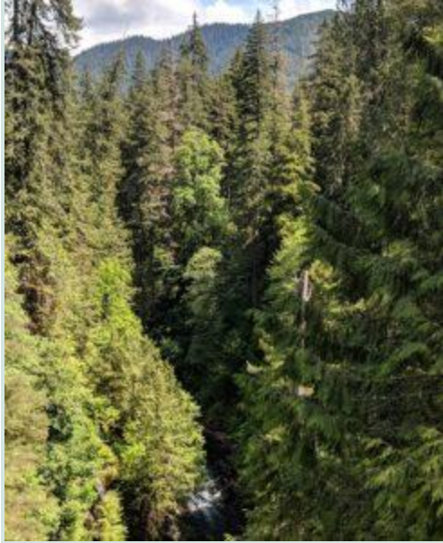
Humptulips Watershed.

On October 8th, the Olympic National Forest (ONF) signed the Humptulips thinning project Decision Memo, which includes forest thinning, culvert removal, stream habitat restoration, and other aquatic restoration items. The Humptulips watershed is approximately 17 miles south of Quinault in Grays Harbor County, Washington. The area is a Western-Hemlock dominated site, with some Douglas-fir, Western Red Cedar and Red Alder. The Olympic Forest Collaborative has worked to assist and support the development of this project and will help with pre-sale activities as well as pre- and post monitoring of forest health.