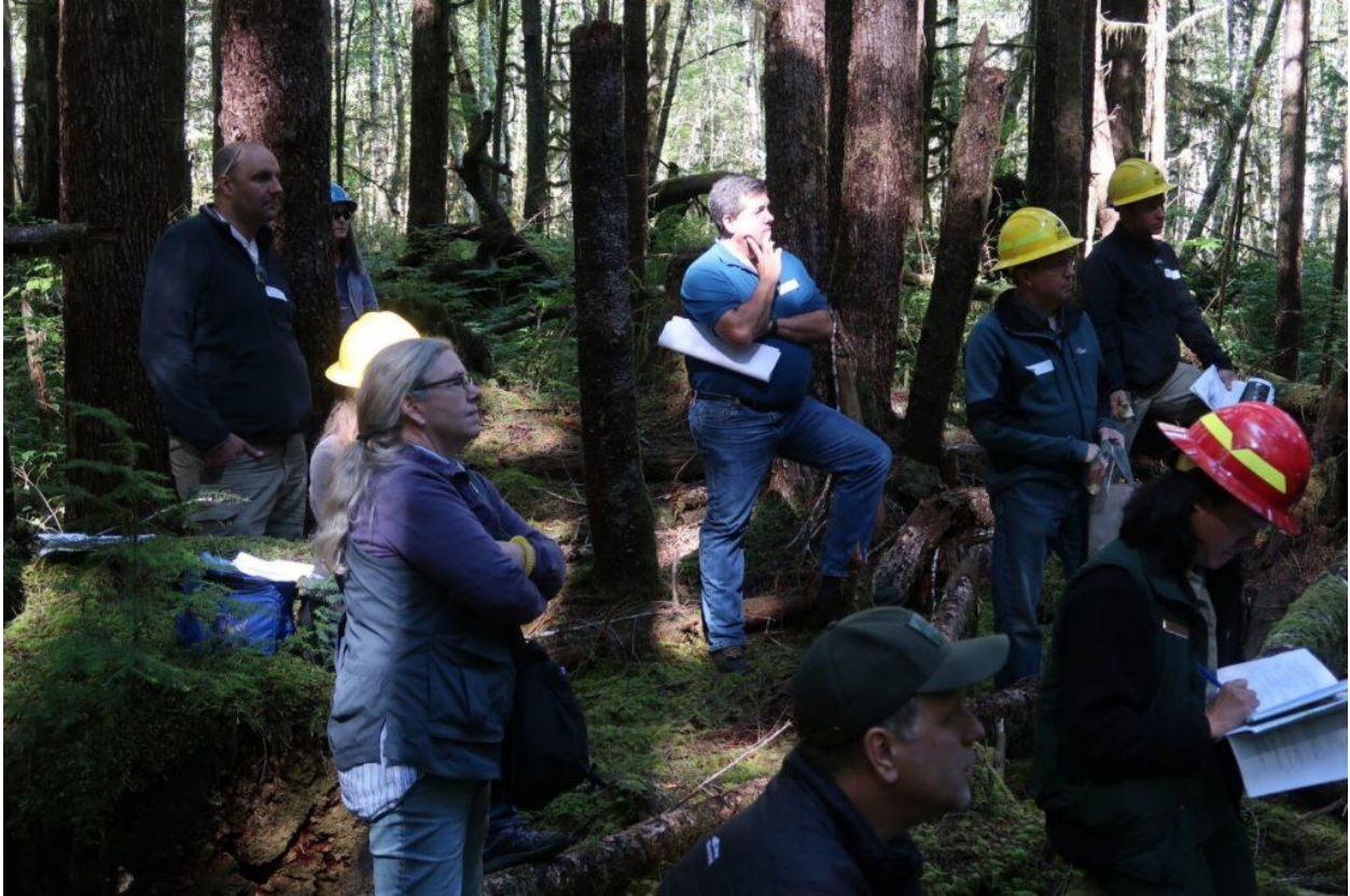
Participants from the Olympic Collaborative and the Olympic National Forest at the Wynoochee Field Meeting