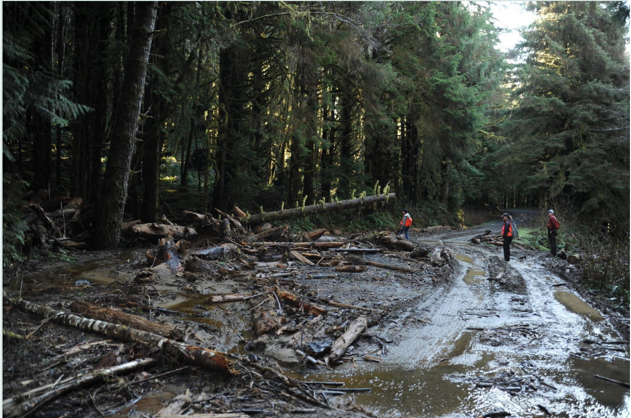
At a junction on the 2900 Rd.

On February 16th, the Olympic Collaborative attended a presentation by Olympic National Forest (ONF) Hydrologist, Andrew Stonebreaker, on flood and storm damage from the November 2021 atmospheric river that heavily impacted the Olympic Peninsula and the Olympic National Forest. Stonebreaker presented an interactive map of the atmospheric river damage along the ONF 2900 Road, including culvert inlets plugged by debris flow, small landslides, surface slumps, and culvert blowouts. Atmospheric rivers are large bands of water vapor from tropical waters that, when they meet land, release unprecedented amounts of moisture. Atmospheric rivers can be beneficial at the best of times, such as alleviating drought, and extremely hazardous at other times, such as last November's storm. As these extreme events occur more frequently with climate change, the Olympic Forest Collaborative is committed to supporting the Olympic National Forest and our Lead Entity partners to identify and respond to these sites, our shared goals being to maintain water quality, forest health and accessibility conditions for everyone impacted on the Olympic Peninsula.