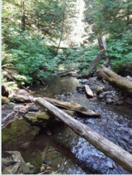
Resilient Forestry field crew captures a view of the Wynoochee project site.

The Olympic Forest Collaborative is excited to announce that the Environmental Assessment for the Wynoochee Restoration and Road Management project has been signed by the Forest Service, as of August 13th, 2021. The Collaborative provided comments during the draft plan public comment period. The Wynoochee project encompasses more than 40,000 acres managed by the Olympic National Forest in Grays Harbor County. The EA found the following needs for this project are: (1) to increase structural and habitat diversity via reducing the density of trees in second-growth LSRs; (2) to contribute to the economic vitality of local communities; (3) to improve Riparian Reserve conditions to meet Aquatic Conservation Strategy Objectives; and, (4) to create a road system that meets transportation needs while reducing risk to aquatic habitats. The OFC is assisting the ONF with a restoration thinning stewardship sale for one of the units as part of the final decision.