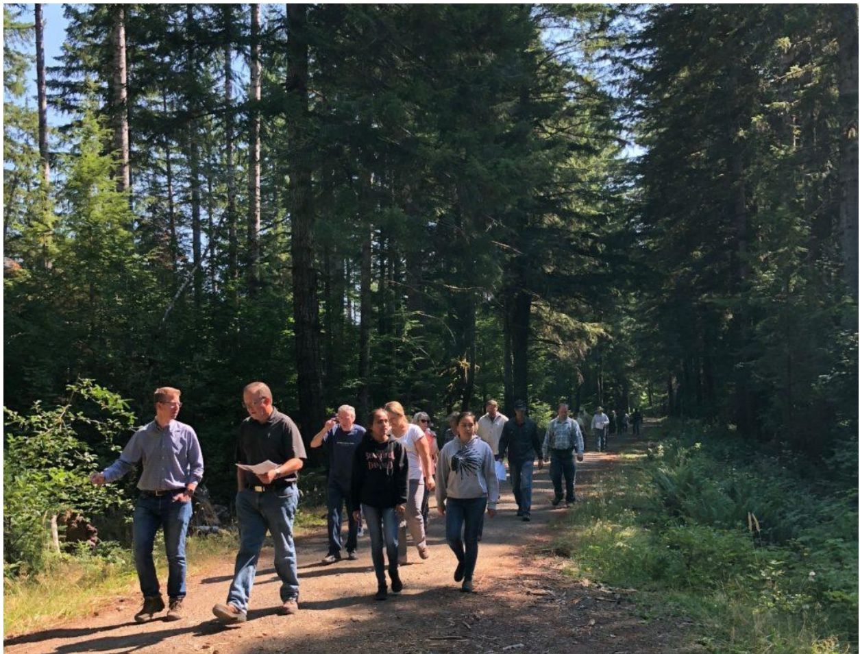
U. S. Representative Derek Kimer hosting field tour

understory plant diversity and improve habitat for sensitive and threatened species. The Field Tour discussed the Olympic Collaborative's role in the H to Z project, remarks about the efforts by the Olympic Collaborative by U.S. Representative Derek Kilmer (D-WA06) and a question and answer portion with stakeholders and members of the Collaborative. The tour was well attended with more than 30 participants including U.S. Congressman Derek Kilmer, State Representative Mike Chapman, Clallam County Councilmember Bill Peach, Forks Mayor, Port Angeles Mayor Sissi Bruch, Port of Port Angeles Commissioner Connie Beauvais and representatives from Olympic Natural Resources Center, North Olympic Timber Action Committee, Coast Salmon Partnership, the Hoh and Quileute Tribes