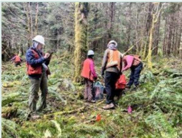
Resilient Forestry in the field